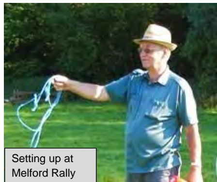
Setting up at Melford Rally