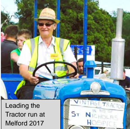
Leading the Tractor run at Melford 2017